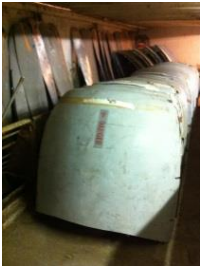
Super Constellation Cowling 1 segment