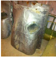
DC-6 Oil Scoop Back section