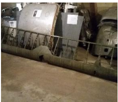
DC-3 Aileron cpl