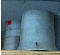
F4 Engine Bell