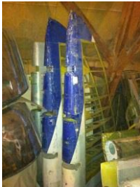
Super Constellation Rudder