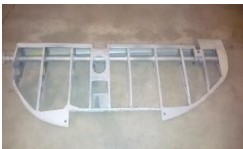
Texan T-6 Elevator (sandgestrahlt)