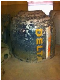
DC-6 Cowling 1 segment