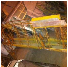
Cessna T-50 Elevator