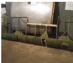
DC-3 Aileron cpl