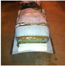
DC-6 Oil Scoop