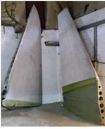
DC-3 Horizontal Stabilizer