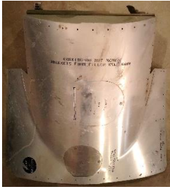
T-33 Fuel Tank Cover