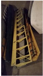
Texan T-6 Aileron