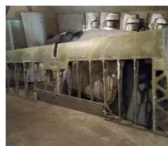
C-47 Elevator cpl