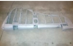
Texan T-6 Rudder (sandgestrahlt)