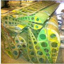
DC-3 Aileron large 2 matching segments