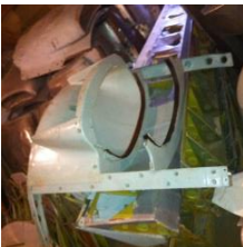
DC-6 Engine Cage