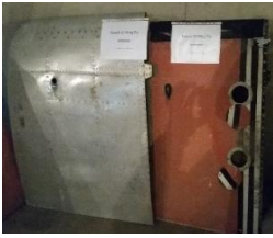
Beech 18 Wing Tip