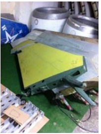
Fiat G-91 Elevator