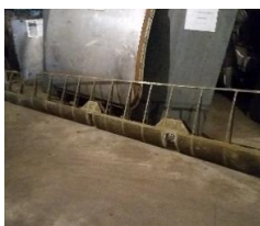
DC-3 Aileron cpl