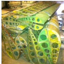
DC-3 Aileron small 2 matching segments