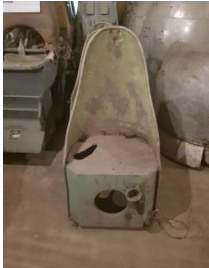
Pilot Seat small