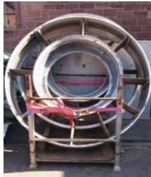
DC-10 Engine part