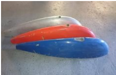
T-6 Wing Tip