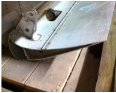
DC-9 Slat short