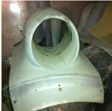
DC-3 Oil Scoop