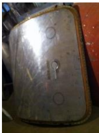
DC-9 Cargo Door