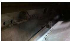
DC-9 Slat large