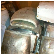
DC-6 Air Scoop