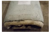
Air Scoop DC-6