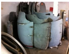
Super Constellation Cowling complete